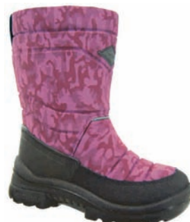
Cyclamen Ghost 1203 4837 Sizes: 20-39