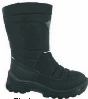
Black 1203 03 Sizes: 20-39