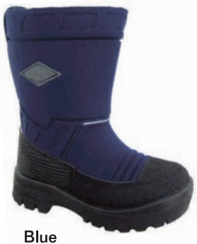
Blue 1253 01 Sizes: 20-39

Extra reinforcement of PU coated split leather on the toe