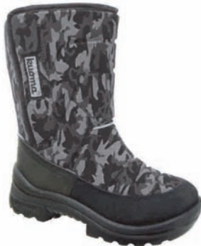
Black Ghost 1211 0337 Sizes: 20-35