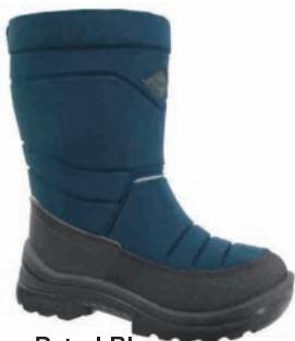
Petrol Blue 1203 07 Sizes: 20-39