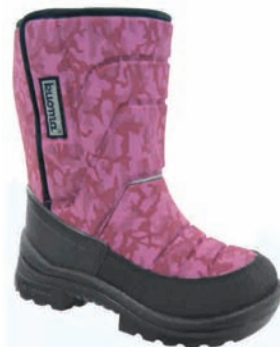
Cyclamen Ghost 1211 4837 Sizes: 20-35