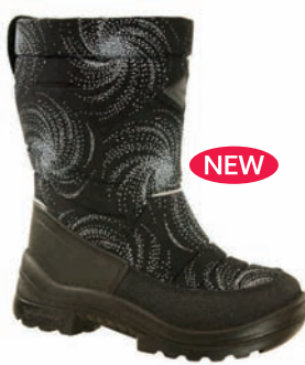
Black Shine 1203 0347 Sizes: 20-39