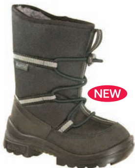
Black 1207 03 Sizes: 20-39