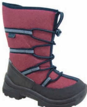
Red 1207 04 Sizes: 20-39