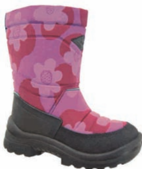
Cyclamen Flower 1203 4826 Sizes: 20-39