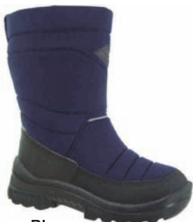
Blue 1203 01 Sizes: 20-39