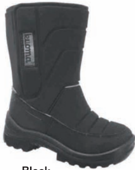
Black 1211 03 Sizes: 20-35