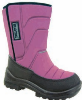
Cyclamen 1211 48 Sizes: 20-35