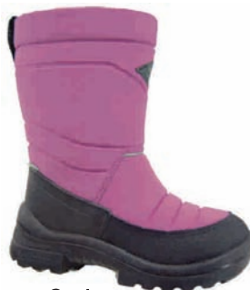
Cyclamen 1203 48 Sizes: 20-39