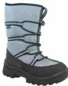
Silver 1207 51 Sizes: 20-39