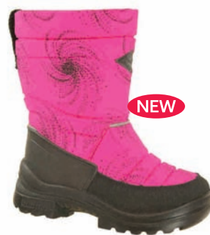
Pink Shine 1203 3747 Sizes: 20-39