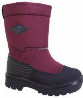
Bordeaux 1253 08 Sizes: 20-39