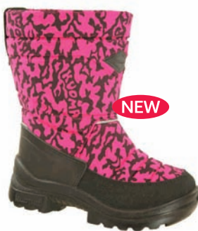
Pink Kuoma Ghost 1203 3748 Sizes: 20-39