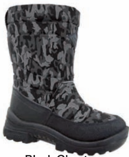
Black Ghost 1203 0337 Sizes: 20-39