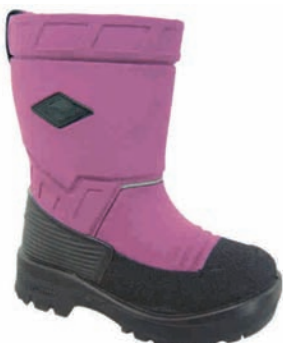
Cyclamen 1253 48 Sizes: 20-39