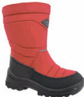
Red 1203 04 Sizes: 20-39