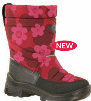
Bordeaux Flower 1203 0826 Sizes: 20-39