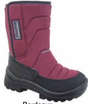
Bordeaux 1211 08 Sizes: 20-35