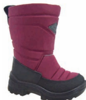
Bordeaux 1203 08 Sizes: 20-39