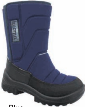
Blue 1211 01 Sizes: 20-35