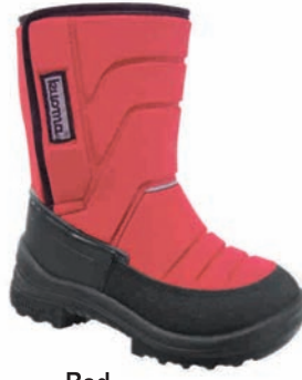
Red 1211 04 Sizes: 20-35