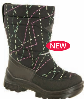
Black Stitch 1203 0349 Sizes: 20-39