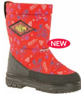
Red Winter 1203 0445 Sizes: 20-39