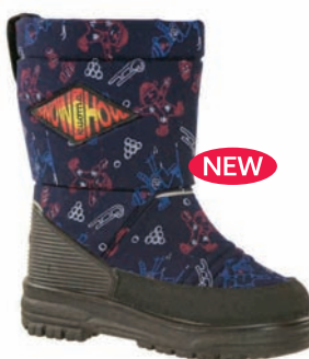
Blue Winter 1203 0145 Sizes: 20-39