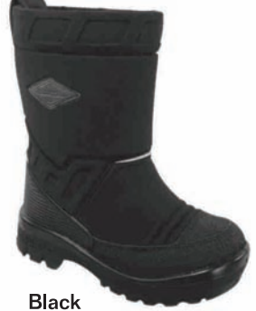
Black 1253 03 Sizes: 20-39